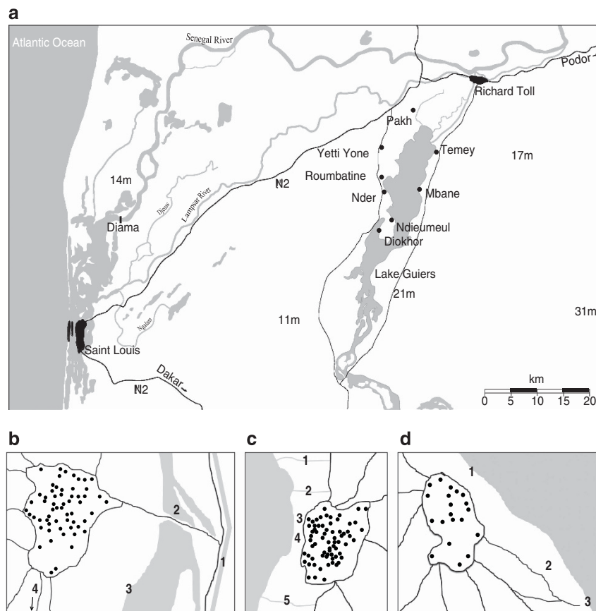
Figure 1 (a) Map of northern Senegal showing the three major water bodies (Lake Guiers, Senegal River and its tributaries Lampsar River and Djeuss), the national road N2, cities Saint-Louis and Richard Toll and the location of the study villages (Pakh, Yeti Yone, Roumbatine, Nder, Diokhor Tack, Ndieumeul, Mbane and Temey). While snails were collected in all villages, human samples were only collected in Pakh, Diokhor and Ndieumeul. The elevation of some geographic points are indicated in meters above sea level. Detailed maps of Pakh (b), Diokhor (c) and Ndieumeul (d): dots are households, black lines are 'roads', grey areas are water and numbers indicate the known transmission sites within each village.

(Belkhir et al. , 1996–2004). The inbreeding coefficient F_{IS} , defined as the probability that two alleles at a locus are identical by descent, was estimated in GENETIX at the village and at the host level using f (Weir and Cockerham, 1984), tested for significance using 10 000 permutations and corrected for multiple testing using sequential Bonferroni corrections. Parasite allelic richness (AR; which corrects the number of alleles per locus for unequal sample sizes) was estimated based on a minimum of two alleles per host and per village using the R package HIERFSTAT v0.04-6 (Goudet, 2005). The same analyses were also performed for the cercarial population of Ndieumeul, which was the only sample with a sufficient amount of infected snails (see Results section).