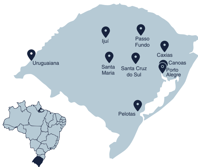
Fig. 1 | Locations of the nine sentinel cities. Inset: location of the state of Rio Grande do Sul in Brazil.

the progression of the pandemic in the places where the virus was most likely to be introduced in the state.