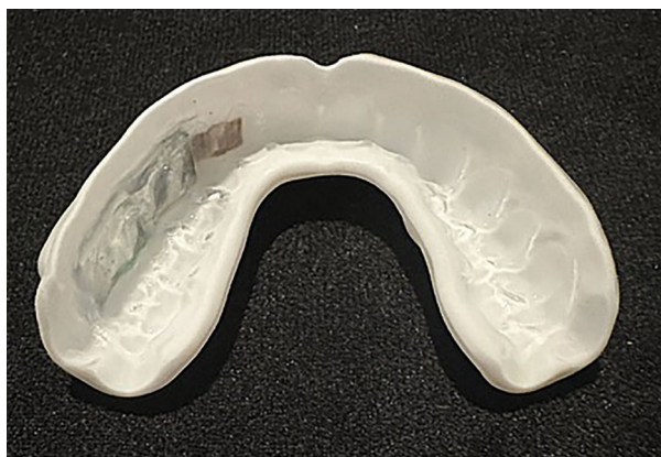
Fig. 4 Current size of technology

iMGs can provide feedback on an athlete's movement and technique. Coaches can determine whether certain movements or positions correlate with a higher risk of injury and suggest corrective measures. Coaches can work with players to adjust their