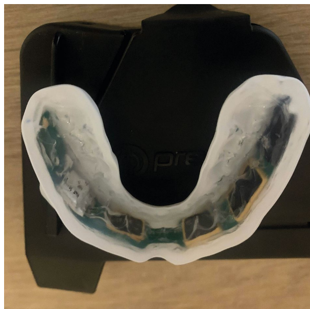
Fig. 3 Technology placed on buccal surface of the mouthguard

on-field HAEs. 26 iMGs can provide real-time data, which allows for immediate assessment of the severity of an impact. If an athlete experiences an impact to the head, the data can indicate whether the force was high enough to warrant immediate evaluation for concussion. These devices help provide objective data to support sports medical teams with symptom assessment.