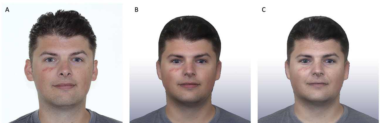
Figure 2. Avatar creation process. (A) Source image; (B) digital avatar version reflecting present self; (C) aged avatar version reflecting Future Self. Informed consent was obtained from the participant for publishing their image.

Next, participants were requested to sort a virtual stack of 24 cards, each displaying a positive or a negative statement related to health, financial situation, or social contacts (e.g., "I take care of my health", "I have debts", "I avoid people who are bad for me") by placing them into either a YES or a NO box, depending on whether the statement applied to them or not. After completing this task, participants 'time-travelled' to the other side of the virtual table by pulling a (virtual) lever located on the table, to embody their FS avatar. Participants were